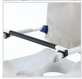
SAFETY SUPPORT BAR 10167-10