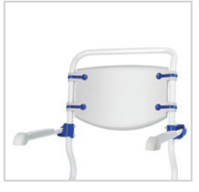
HYGIENE BACK 1575299