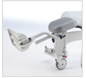
LEGREST COMPLETE AP1643572 - LEFT AP1643543 - RIGHT