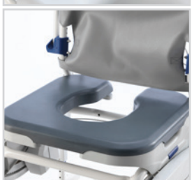
VARIABLE SOFT SEAT SET COMPLETE (GREY) 1544469