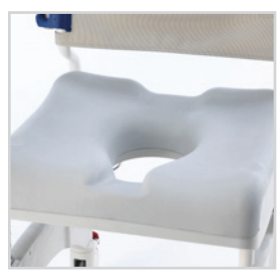
SMALL SOFT SEAT AP1603145