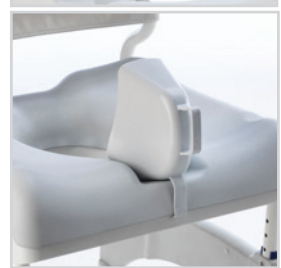
SPLASH SHIELD AP1603155