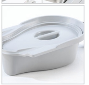
COLLECTION PAN WITH LID 10230