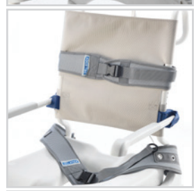
CHEST BELT PADDED w/ STAINLESS HARDWARE 1470081