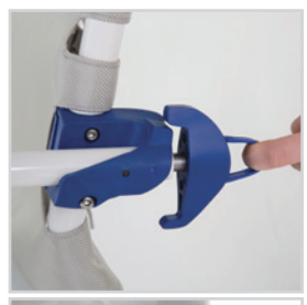
ARMREST LOCK 1470077